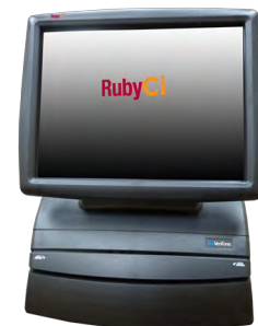
RubyCi—Ruby2 Commander with Built-in Commander16