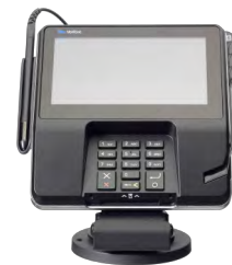
Mx915 Pinpad w/Stand